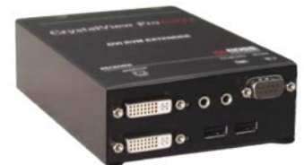
CrystalView DVI CATx (USB model)