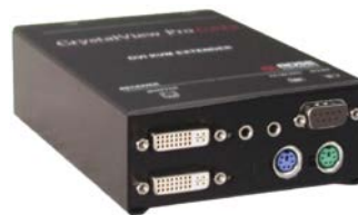
CrystalView DVI CATx (PS/2 model)