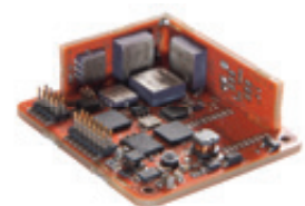
OEM: 37x33x12 mm, 11g, 24-pins header