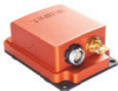
MTi-G encased: 57x42x23.5 mm, 55g, 9-pins push-pull connector