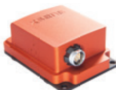
MTi encased: 57x42x23.5 mm, 52g, 9-pins push-pull connector