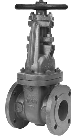
F-637-31 Flanged-Raised Face