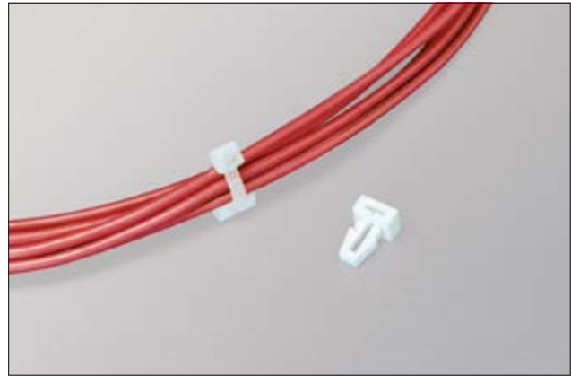
TM1SF Fixing Base for pre-drilled or pre-punched holes.