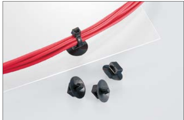
Securely fix and route cables and pipes with SFC3.